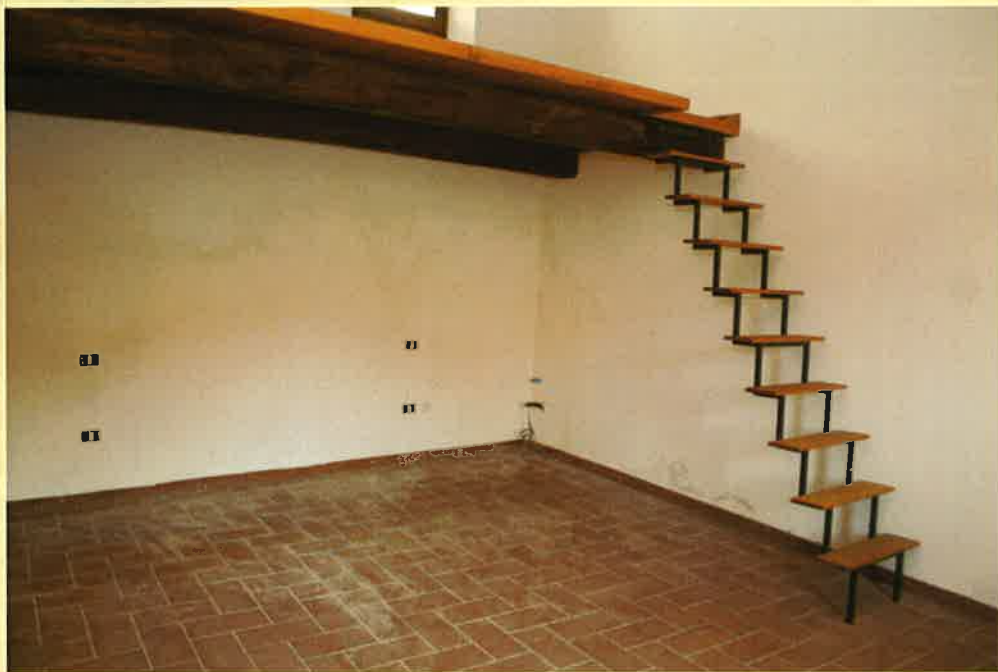
Examples of internal solutions